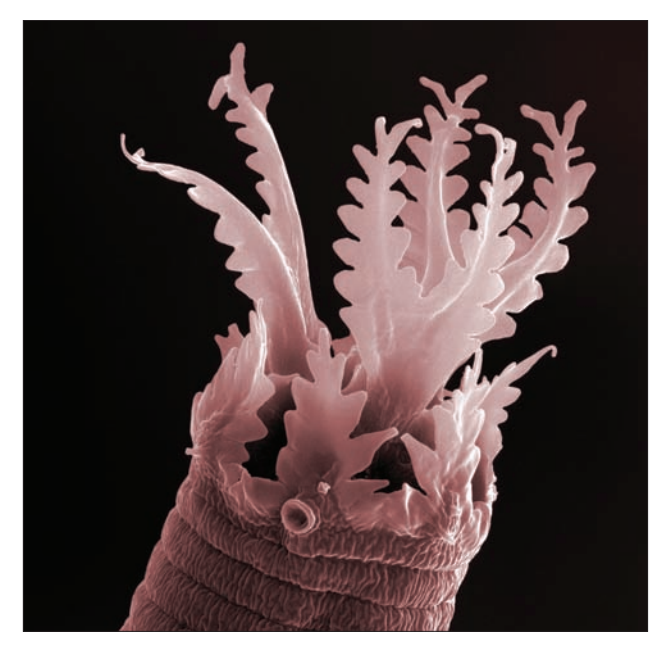
Fig. 1 Scanning electron micrograph of the head of a soildwelling cephalobomorph nematode ( Acrobeles complexus ).

The internal phylogeny of the Nematoda has been much debated also, and molecular data are being brought to bear (4-6). While no complete system has yet been devised, there are some general areas of agreement between different studies that also have morphological support (7, 8). The Nematoda has three classes: Enoplia, Dorylaimia, and Chromadoria. The relative branching order of these has not been determined. All three classes contain parasitic groups, and whole-phylum analyses suggest that animal and plant parasitisms have arisen independently at least six and three times, respectively (9). Within the Chromadoria, the free-living model species Caenorhabditis elegans is part of a radiation of terrestrial