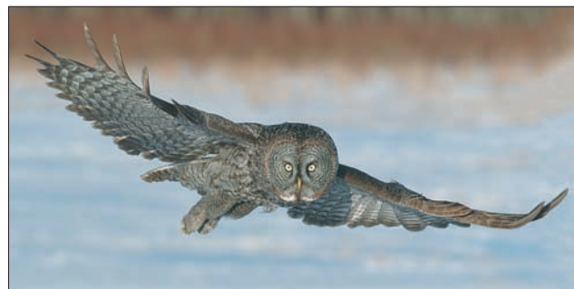
Fig. 1 A Great Grey Owl ( Strix nebulosa ), Family Strigidae, from Coronado, Alberta.

Relationships of the owls to other avian orders is presently unclear. Historically, Strigiformes has been linked to either the nocturnal nightbirds (Order Caprimulgiformes) (1, 22, 23) or the diurnal raptors (Order Falconiformes) (5). Owls share several morphological characteristics that are separately mirrored in these two orders: the adaptations to a raptorial lifestyle (strong bill and feet) resemble those found in the falconiforms, whereas apparent adaptations to a nocturnal existence